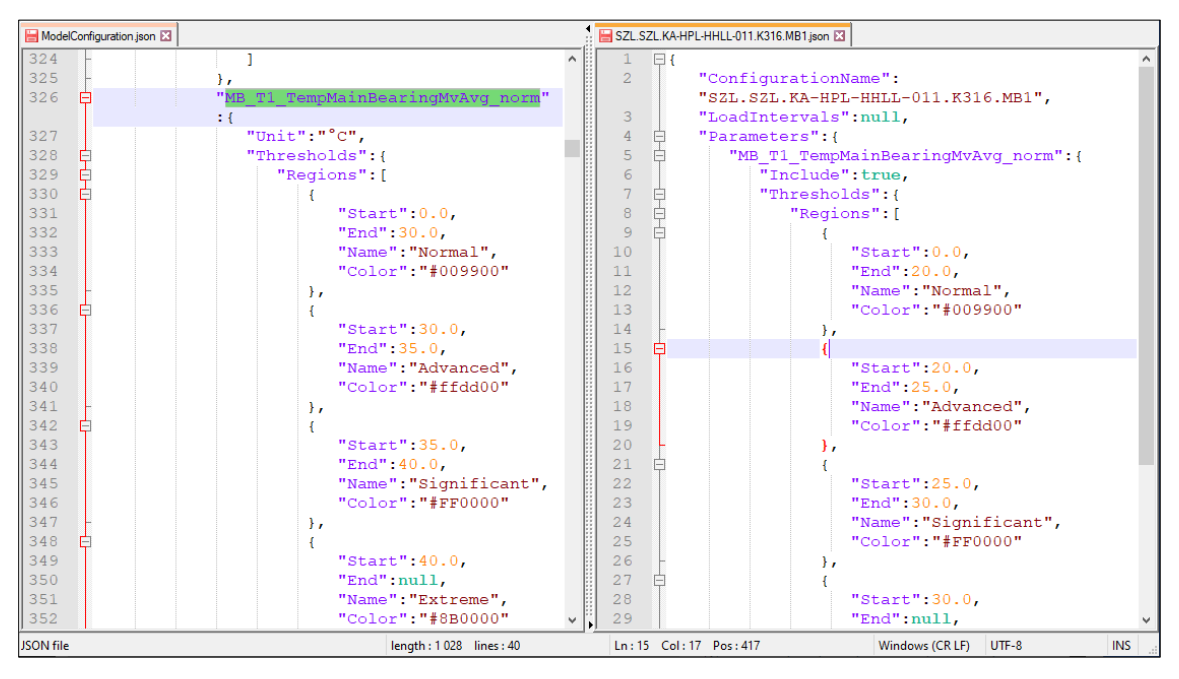
Example of an asset named configuration (in the right tab)